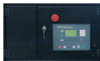
Deep Sea 7510 Loadshare Control Panel